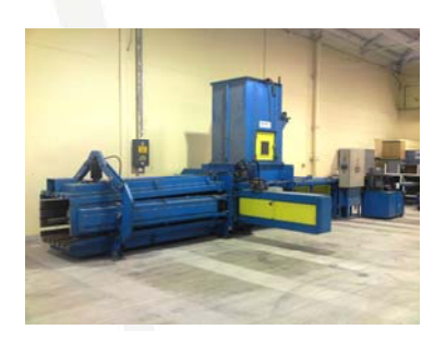
(Photographs prior to refurbishment)