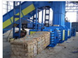
Factory Refurbished ATS 75.75 60Ton Autobaler

Refurbished ATS 110.75 Automatic Channel Baler