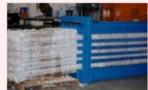
HB3 Semi Automatic Channel Baler

Paal Shredder: RWNO 11/810, 17mm cut Twin shaft shredder Available NOW.