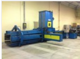
Refurbished ATS 110.75 Automatic Channel Baler

Autobaler has the expertise to refurbish and update this equipment to provide a cost effective solution, in addition we at Autobaler can refurbish your existing waste equipment giving it a new lease of life.