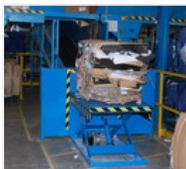
Refurbished Mini Bale lift table

Refurbished ,Mini Bale Handling:- Lifting Table