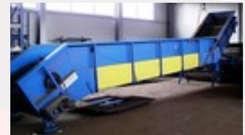
Refurbished Chain driven conveyor 1300mm

Factory Refurbished:- Anis Trend ATS 75.75 22kw – 60Ton force Autobaler