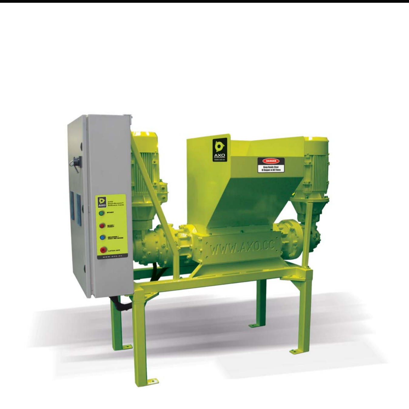
WM432E / WM608E