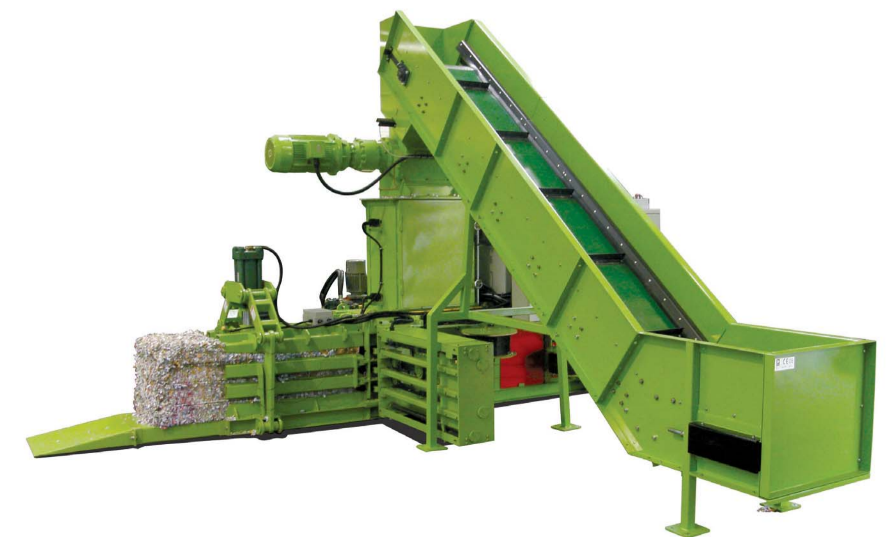
Conveyors / Auto Tie Balers